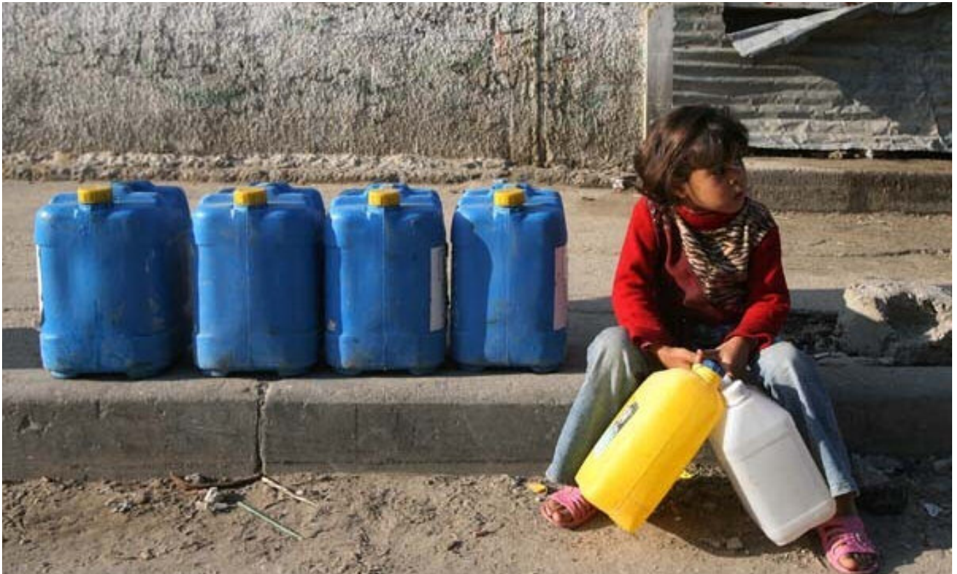
A Palestinian girl takes a rest on her way to collect drinking water in Gaza, where more than 90 per cent of the water available is polluted and unfit for human consumption.