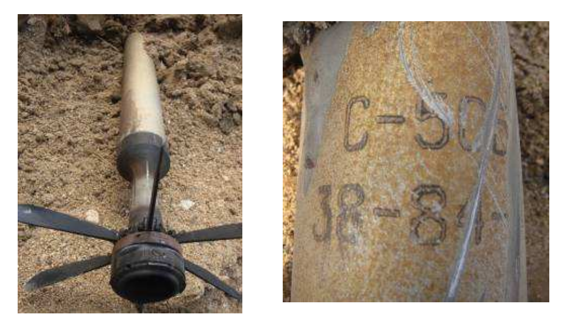
Remnants of S5SB (flechette-variant) 57mm air-to-ground rockets in Southern Kordofan in June 2011, after SAF aerial strikes in Kauda.