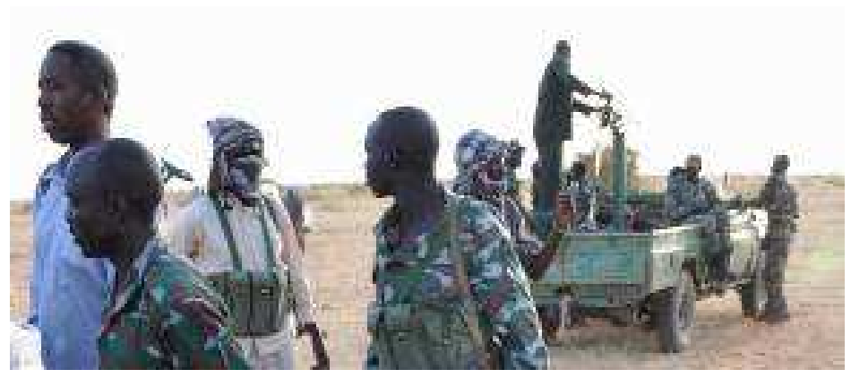
Above, PDF elements patrolling, and below, collecting the dead body of the victim of an attack reportedly perpetrated by elements of armed opposition group, in early 2011.

Attacks on civilian settlements and property by armed opposition groups have also continued in violation of international humanitarian law. Reportedly as a reprisal for the 31 May killings, several dozen armed men mounted on vehicles and camels attacked Shangel Tobaya town on 17 June, killing 19 people including 13 civilians and injuring 35 more. Over 100 houses were burnt. While no group publicly claimed responsibility for the attack, local traditional leaders and individuals affiliated with SLA-M have reported that the operation was organized by armed opposition groups including SLA-M members, although Zaghawa civilians were also reportedly involved in the raid.