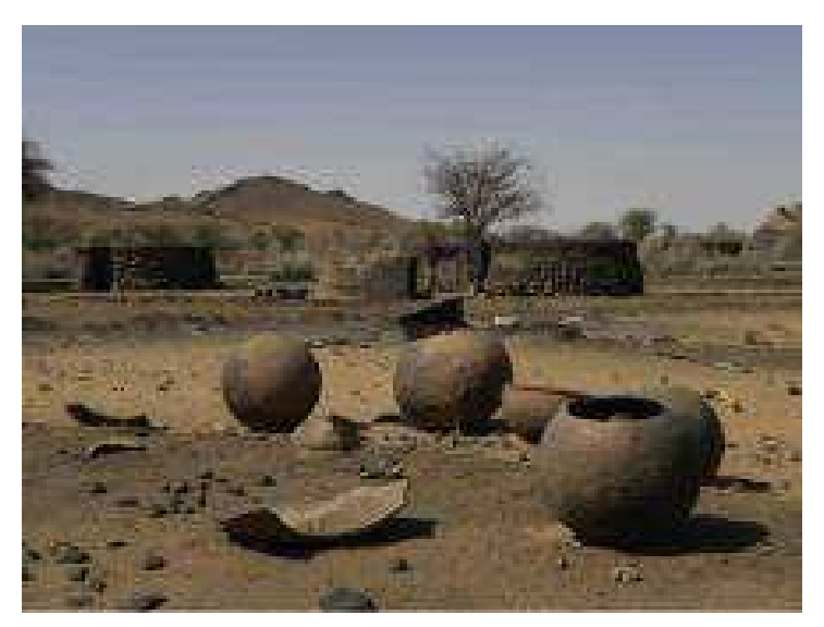
The burnt village of Tukumare, reportedly attacked by SAF and PDF elements in January 2011.