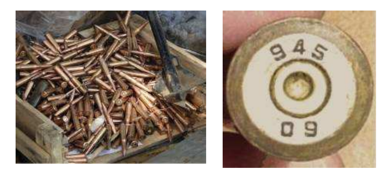
On the left, a box of ammunition captured from SAF in South Kordofan in July 2011. All rounds of ammunition bear identical marking-codes (company code '945' and year of manufacturing code '09'); and on the right, a 7.62x54mm cartridge collected in Darfur in mid-2010 by the UN Panel of Experts on the Sudan (see S/2011/11). The headstamp bears the company code '945' and year of manufacturing code '09' as in 2009.

Recently manufactured ammunition bearing Chinese-manufacture company codes reportedly continue to be used to commit serious human rights violations. For example, on 1 December 2011, CRP personnel in Zam Zam IDP camp, south of El Fasher, carried out a looting raid during which one man was shot dead and six other displaced persons were seriously injured. Witnesses contacted by Amnesty International reported finding cartridges following the raid bearing Chinese '41' and '71' manufacture codes, and (20)06 and (20)08 manufacture dates, indicating that it was transferred to Darfur after the imposition of the UN arms embargo.