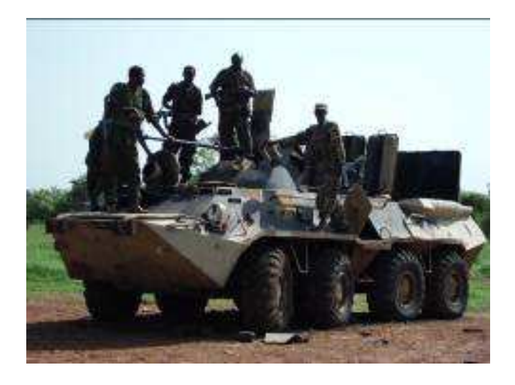
A BTR-80 armoured vehicle seized from SAF in Southern Kordofan.

Amnesty International has also documented the use of both BTR-80A armored vehicles and 107mm multiple-rocket launchers mounted on Land Cruiser-type vehicles in SAF and SAF/PDF operations in Darfur.