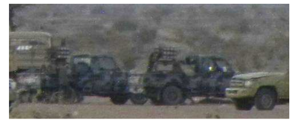
Multi-rocket launchers mounted on military vehicles observed in 2011in eastern Darfur.