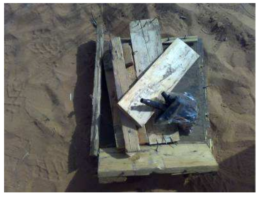
Cartridges collected by the North Darfur Enquiry Committee on the killing of Abu Zerega, in June 2011.

report also concluded that "PDF forces in the area are not obeying the orders of local or state authorities" and recommends "bringing the PDF under the control of the state authorities" .<sup>7</sup>