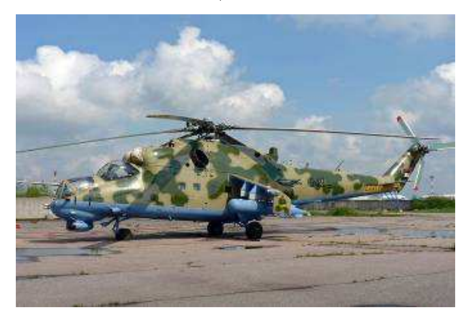
SAF Mi-24P helicopter gunship number 949 photographed at St Petersburg airport, Russian Federation, May 2011

The UN Panel of Experts has previously reported that a Russian company provides maintenance for a fleet of Mi-17 and Mi-24 attack helicopters, and that Sudanese military personnel have been trained at the Combat and Conversion Training centre of the Air Force at Torzhok in Russia as pilots for the Mi-24s.