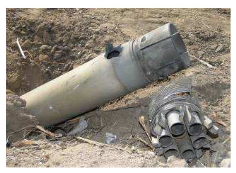
Remnants of S8 80mm air-to-ground rockets in Firga, (Western Bahr el Ghazal State, South Sudan) after a SAF airstrike near an SPLA base, February 2011.