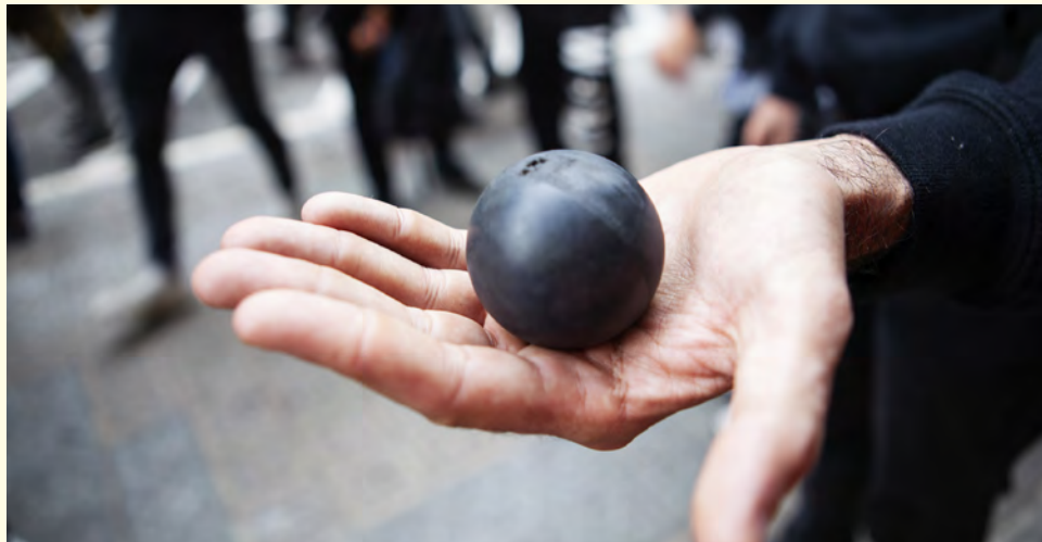
A rubber bullet used by Spanish police forces against protestors in Barcelona, October 2018.