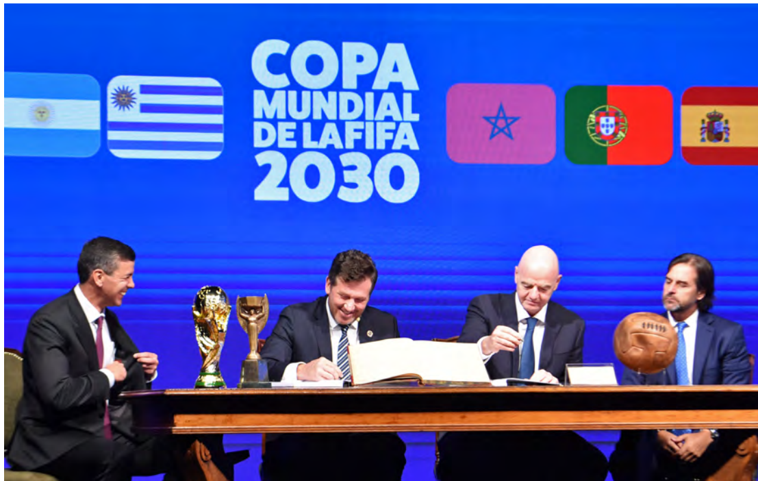
Conmebol's President Alejandro Dominguez (L-2) and FIFA President Gianni Infantino (R-2), accompanied by Paraguay's President Santiago Peña (L) and Uruguay's President Luis Lacalle(R), sign a book of minutes of the 2030 World Cup during Conmebol's 78th Ordinary Congress in Luque, Paraguay on April 11, 2024.

In October 2023, FIFA launched its bidding processes for both the 2030 and 2034 FIFA World Cups, which resulted in only one bid being submitted for each tournament. 3 For 2030, Morocco, Portugal and Spain were invited to submit a joint bid, with three games also to be held in Argentina, Paraguay and Uruguay – who had previously been rivals to host the entire event. For 2034, Saudi Arabia emerged as the sole bidder as FIFA restricted candidates to the Asian Football Confederation and imposed a deadline of under four weeks to apply.