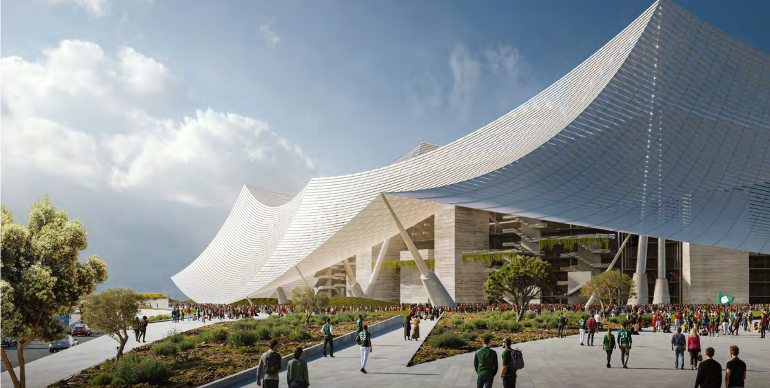
Digital image of the proposed Stade Hassan II stadium in Morocco, projected to be the largest football stadium in the world with 115,000 capacity. (Photo by Populous via Handout/Getty Images).

The Spanish assessment provides a wide-ranging overview of the country's legal framework and challenges in relation to several human rights issues including the protection of minorities, minors, gender equality, LGBTI rights, and people with disabilities; migration, environment, and protections for players and fans within sport (including, in particular racism and xenophobia). 15 It does not, however, provide a tailored assessment in relation to specific risks related to hosting the World Cup, nor does it cover some human rights risks identified by Amnesty International and the SRA. Key areas omitted include risks to workers' rights, the excessive use of force by security forces (including the use of rubber bullets), restrictions on freedom of expression and threats to the availability of affordable accommodation.