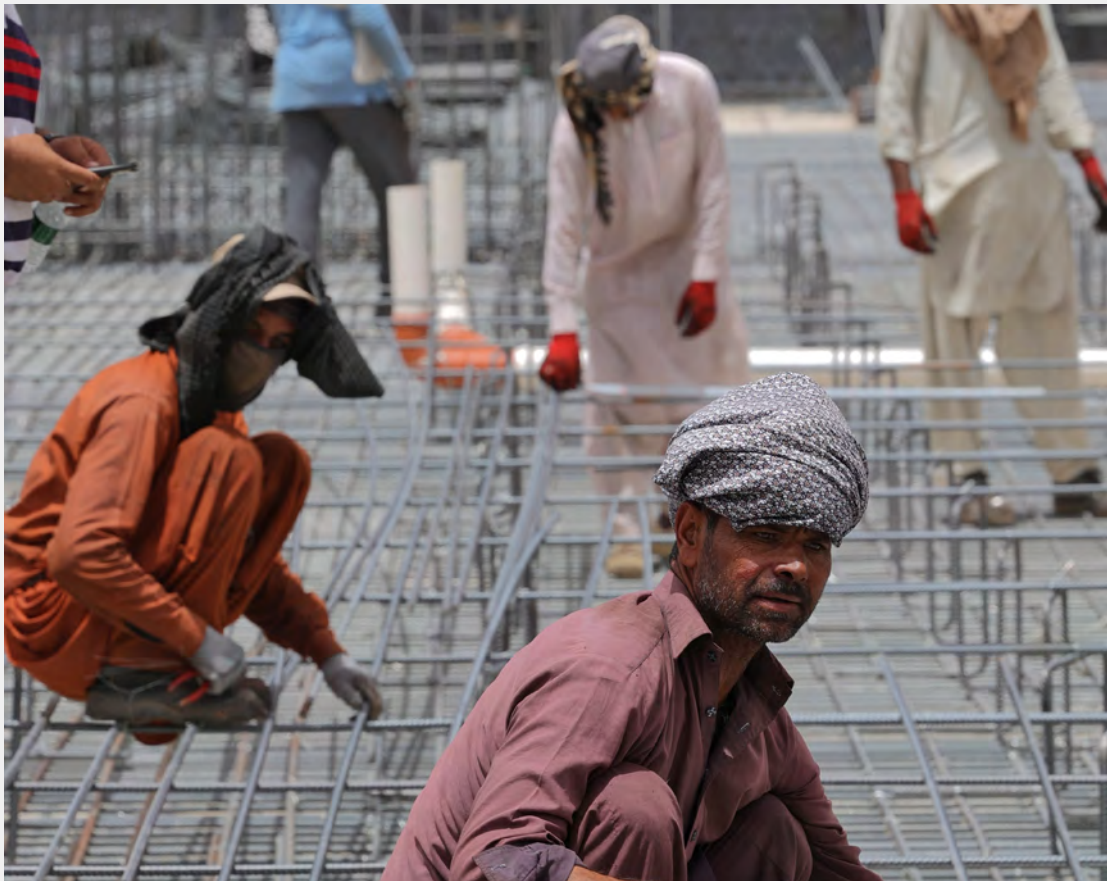
Labourers work on a steel mesh at a construction site in Saudi Arabia's capital Riyadh on May 23, 2022 during a heat wave.

For the 2034 World Cup, the outstanding risks are more severe and the likelihood of widespread violations of human rights in Saudi Arabia – for workers, fans, journalists, residents, players and activists alike – are extremely high. The human rights strategy provided by SAFF does not begin to touch upon the scope and scale of the reforms needed to prevent the 2034 tournament from causing or contributing to severe violations, and clearly does not meet FIFA's human rights criteria. Without change, critical voices will be repressed, fans will face discrimination and workers will suffer exploitation. People will die.