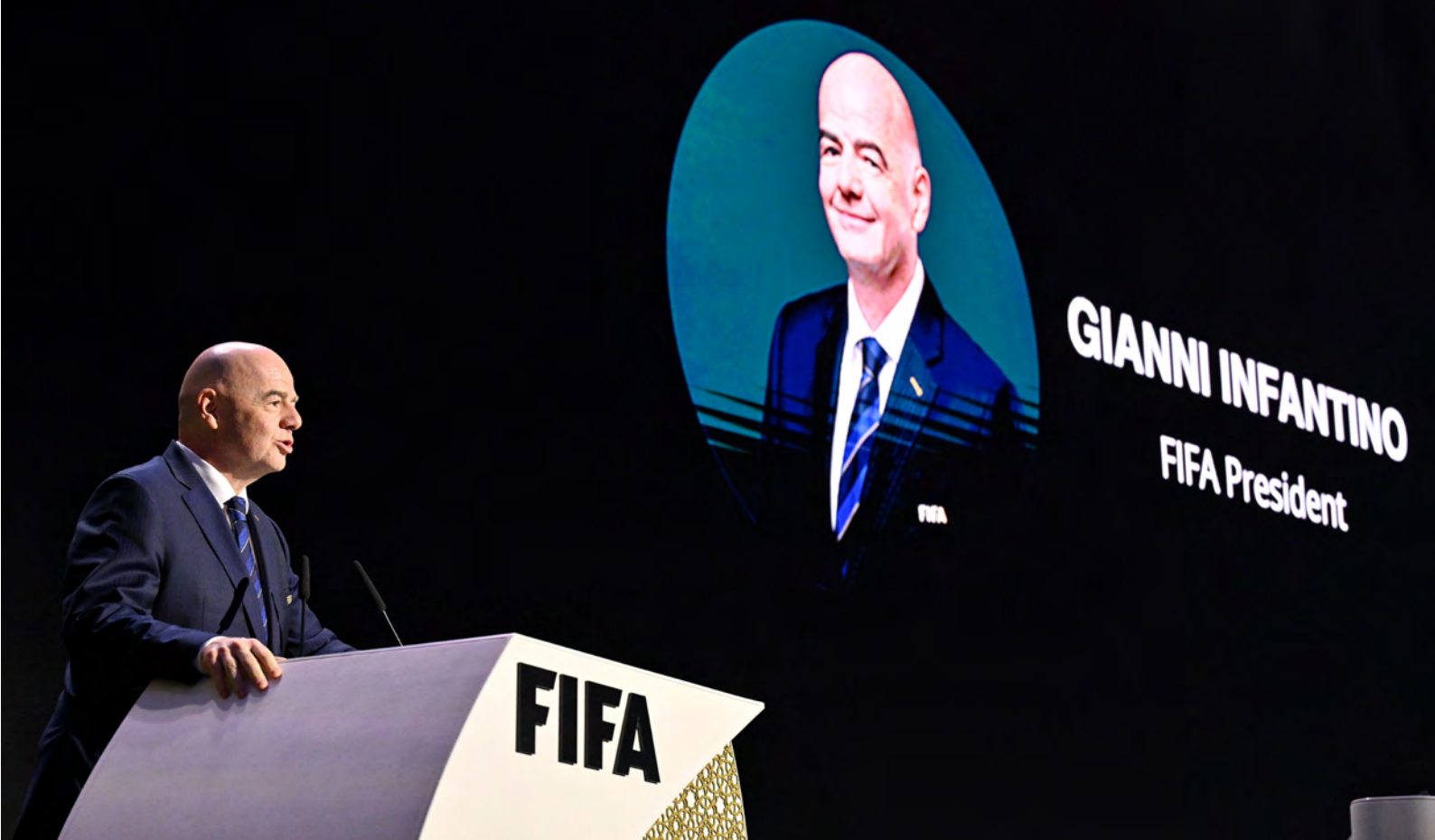
FIFA President Gianni Infantino speaks on stage during FIFA Football Summit 2023 on December 21, 2023 in Jeddah, Saudi Arabia.

3. The assessment relied on desk research and consultation only with government ministries, with no broader consultation. It “did not involve engagement with external stakeholders or rights holders.” 28 Indeed, no human rights organization, trade union, other civil society organization or rights-holders known to Amnesty International or members of the SRA have been consulted – despite Amnesty International and others explicitly requesting this on numerous occasions. It did not make any reference to analysis contained within Amnesty International’s June 2024 report.