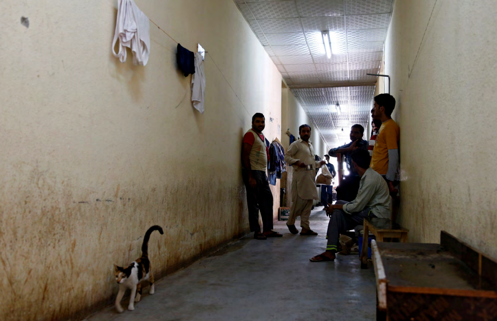
Migrant workers gather at their accommodation in Qadisiya labour camp, Saudi Arabia.