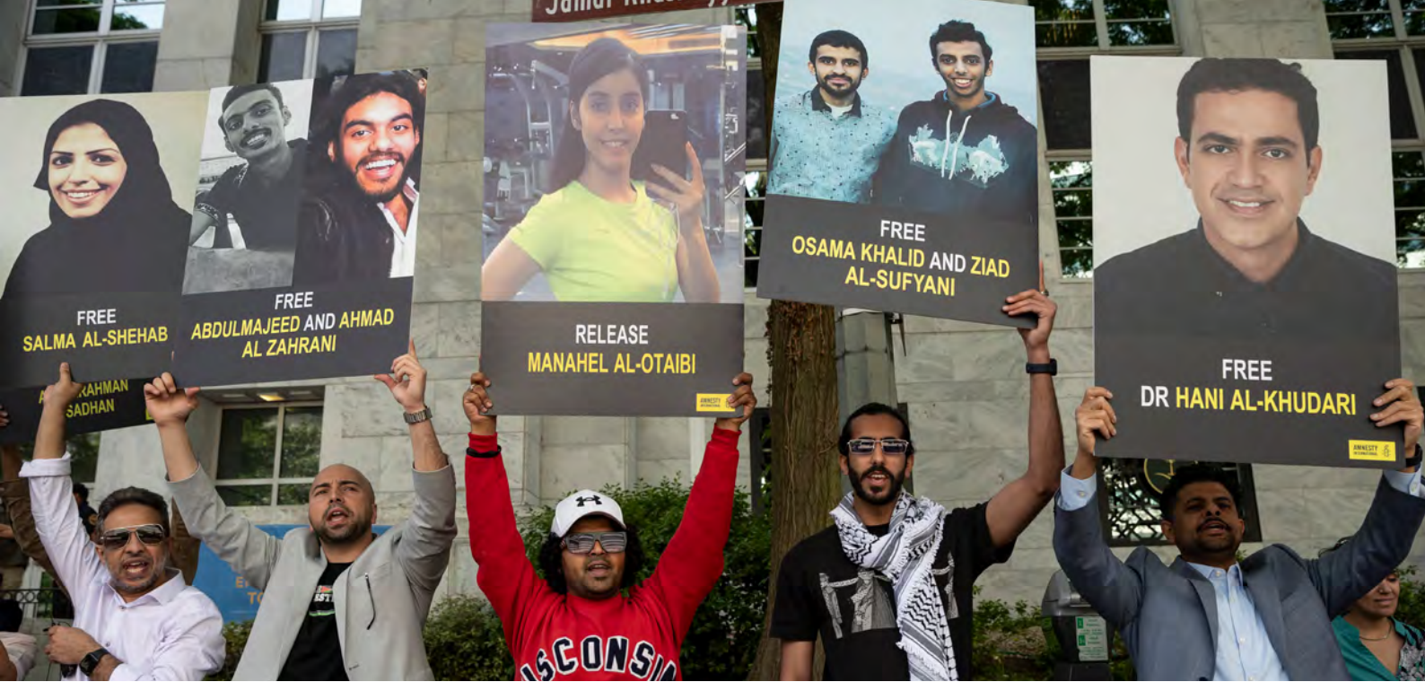
Free Saudi Voices action in front of the Saudi Arabia Embassy in Washington, D.C. calling on Saudi Arabia's authorities to release all those wrongfully detained for exercising their freedom of expression, 2nd of May 2024.