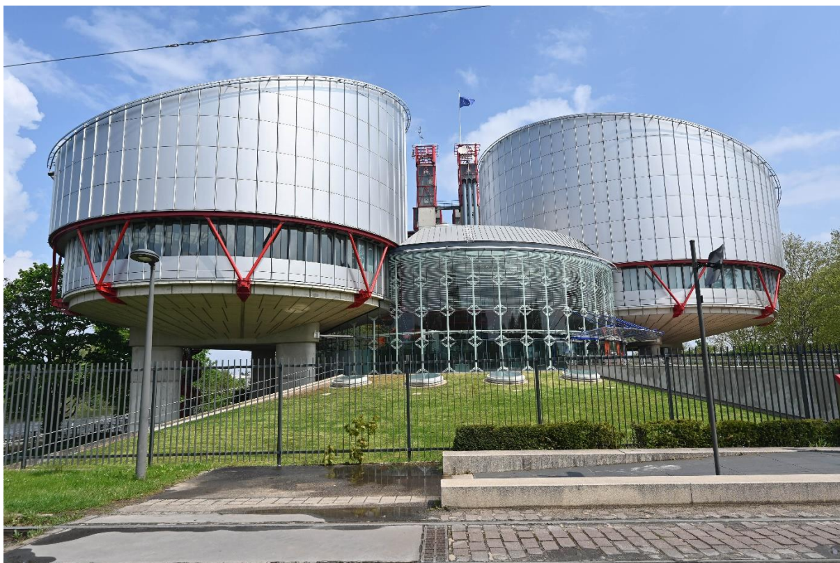
© ↑ Exterior of European Court of Human Rights, Strasbourg (France) © Getty Images (Photo: Mustafa Yalcin/Anadolu Agency)