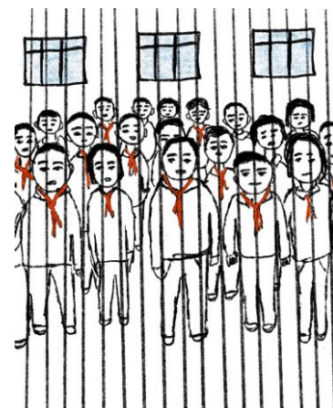
Illustration, children were taken to state-run orphanage and boarding school.

“Just imagine that you cannot call your family, you don’t know whether your children, your parents or your relatives are alive or not for years. Imagine it is not only you, but millions of [Uyghur] people separated from their family members. We never thought this would happen to us, but it has happened. Please help us.”