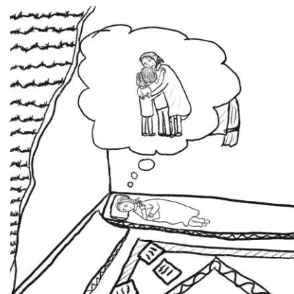
Illustration, a Uyghur mother missing her children in her dream.

“I am ready to sacrifice anything for our daughters. I am ready to sacrifice my life if only I knew my daughters would be set free for it.”