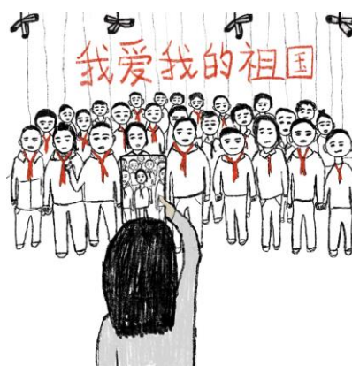
Illustration, children were taken to Aixin Kindergarten, a de-facto orphanage.