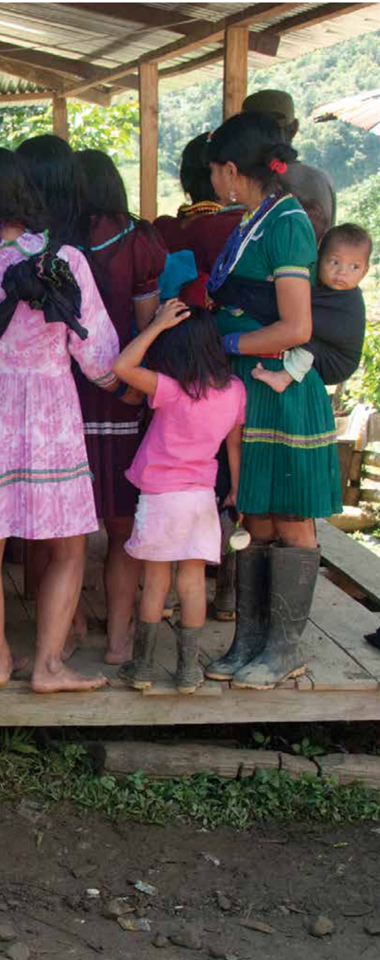
LEFT Indigenous people queueing to receive health care in Aguasal, one of the main hamlets in Alto Andágueda, in 2012.