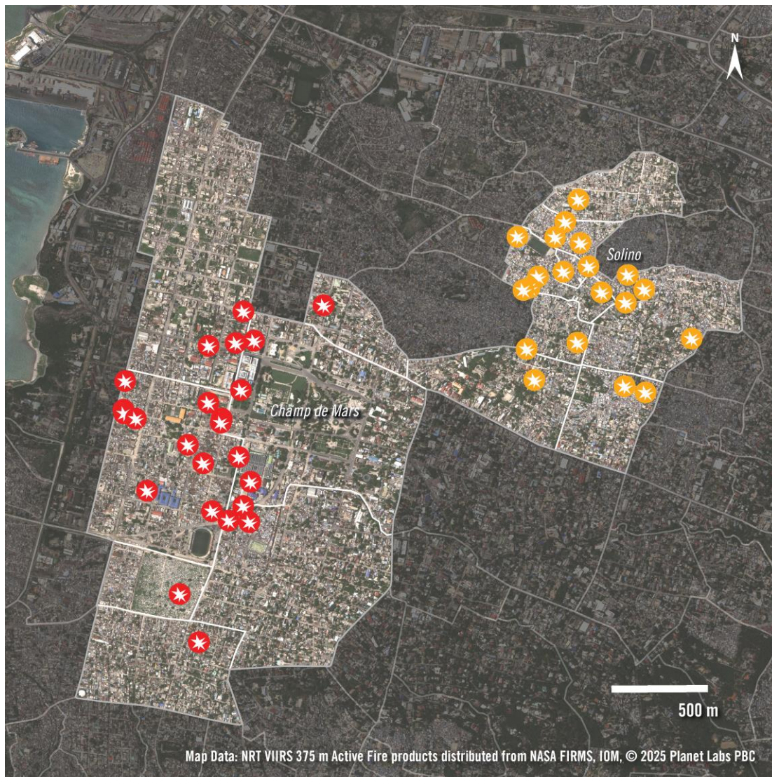
A map of the centre of Port-au-Prince shows fires detected by sensors on NASA satellites during times when heavy fighting and destruction were reported in 2024. A high density and prevalence of fires were detected between 5 February and 1 April 2024 in areas in the west resulting in 24 hotspots, shown with red icons. High density and prevalent fires were also detected to the east between 31 October and 4 December 2024 resulting in 20 hotspots, shown with orange icons. More fires are likely to have occurred than were detected by the sensors.

Testimonies by children underscored the ubiquitous presence of guns around them, including how they are often thrust into their hands and are central in the gangs' acts of violence such as rape. Given that Haiti produces no weapons of its own, containing the illicit trade in arms and preventing diversion of weapons is essential in curbing the abuses committed by gangs. The 14-year-old girl from Cité Soleil who was hit by four bullets in September 2024 said: "I want to tell [the world] to help us change the situation we're in right now in Haiti and remove all the guns... I don't want what happened to me to happen to someone else." 357