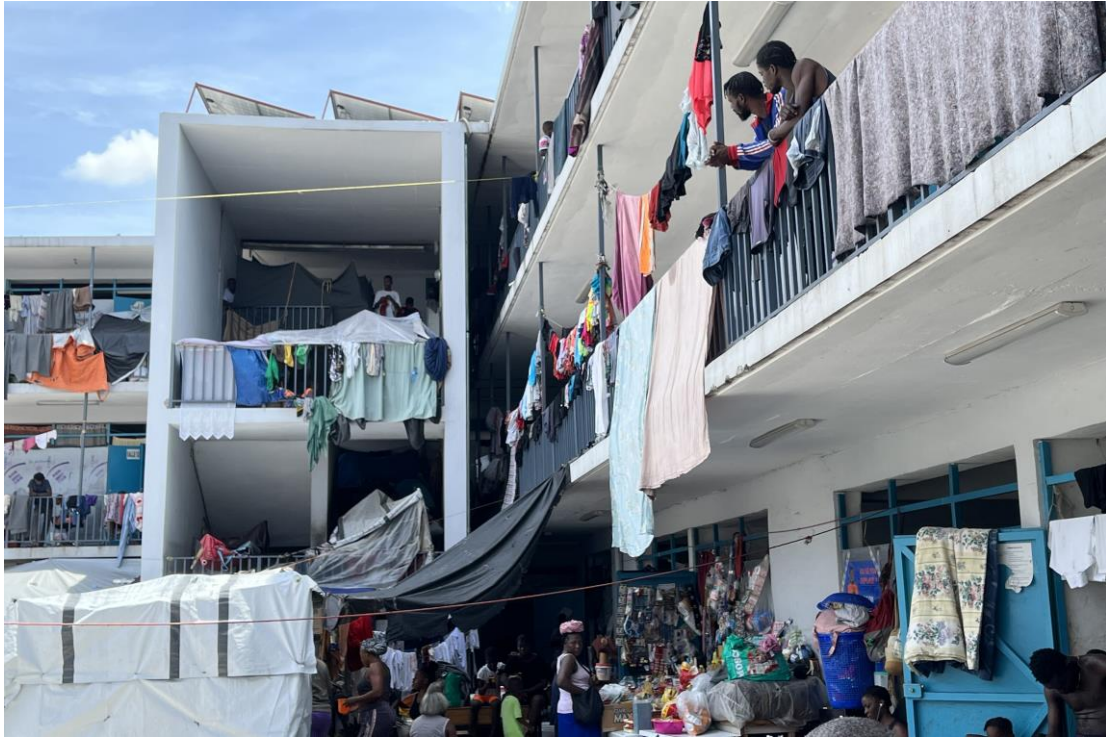
Amnesty International's researchers observed the lack of privacy and crowded conditions in two displacement sites they visited in September 2024. Wide open rooms and uncovered bathing facilities, which aid workers said was common in other camps as well, left girls further exposed.

explain this to you, don't tell anyone, or I will have you killed, or make you disappear.” 253 He then told her that he had digitally raped her, 254 that that was why she was in pain and that there was no reason to cry. When her family found out what happened, they reported it to the police and the man was arrested and is facing legal proceedings. 255 The girl had to move from the camp to a temporary shelter; members of her family stayed behind. 256