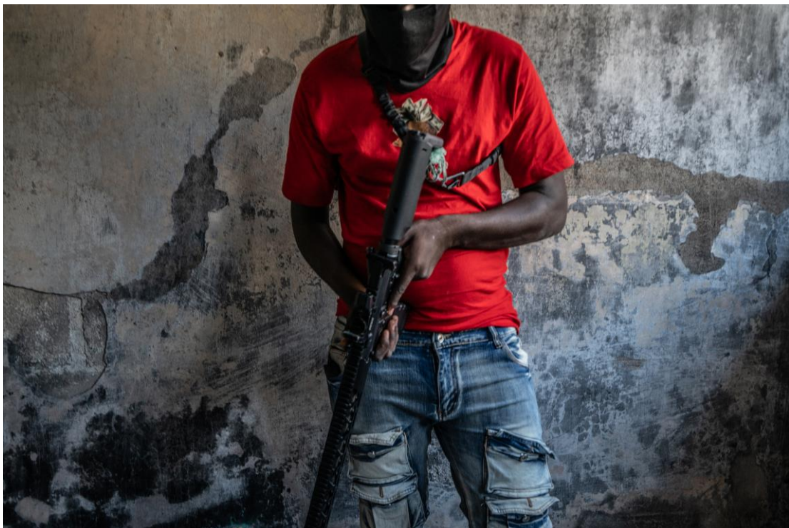
Gang members, such as this one photographed in the capital Port-au-Prince on 22 February 2024, often wear masks in public. In most of the cases documented by Amnesty International, gang members wore masks while raping the girls, an issue that several girls cited as one of the reasons stopping them from reporting the attacks since they could not identify the specific assailants.

In September 2024, Haitian authorities and the UN signed a protocol aimed at the creation of specialized judicial chambers to prosecute “mass crimes, including sexual violence and financial crimes”. 297 Haitian authorities must urgently prioritize the operationalization of the protocol and ensure that these judicial bodies are staffed with professionals specifically trained to attend to victims of these crimes and that they follow victim-centred and trauma-informed procedures. As part of their efforts to ensure effective judicial processes and care for survivors, authorities must also work closely with national and international civil society organizations present in the field and who have been at the forefront of assisting victims and their families.