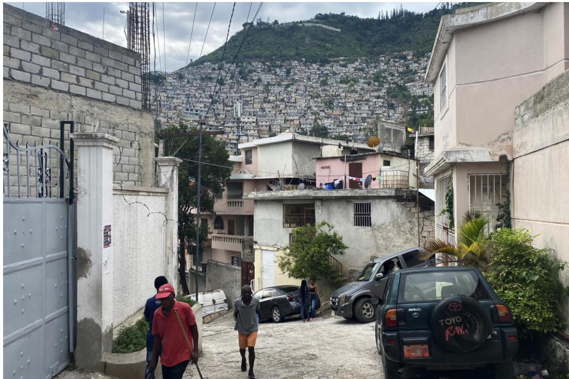
Armed gangs escalated their attacks on the Port-au-Prince metropolitan area and its environs in 2024, taking control of additional areas and further expanding their grip on communities.

On 18 December 2024, Amnesty International wrote to the office of Prime Minister Alix Didier Fils-Aimé, presenting a summary of its findings and requesting information. No response had been received at the time of publication.