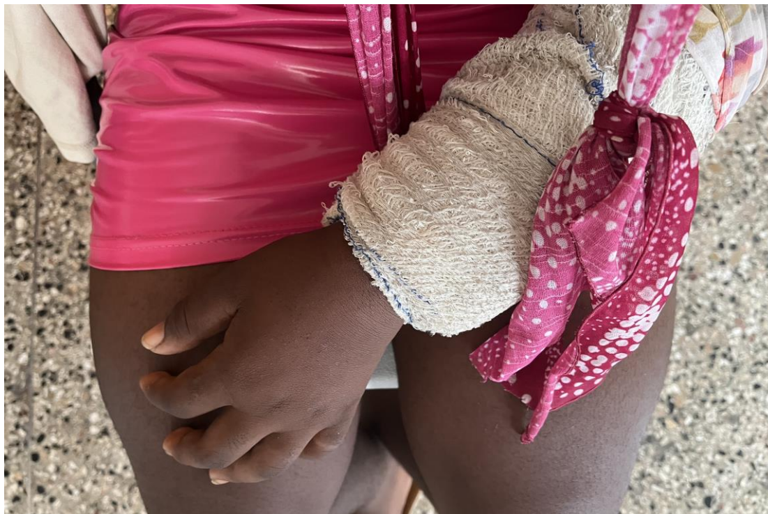
A 14-year-old girl described to Amnesty International being hit by four bullets on 11 September 2024 when gangs clashed after a referee in a football match in Cité Soleil awarded a contested penalty kick.

I was bleeding... I was thinking I'm going to die... I hid in a lottery shop... there were other people hiding there too... I stayed there a while... Someone wrapped my hand to stop the bleeding... Inside, we could still hear the gang members fighting and the shooting outside... I called my mother using someone else's phone... When my mother arrived, we were not able to go outside. Later, someone came to the store and... said we can go outside... We went home... My mother changed my clothes to go to the hospital... Since then, I don't go out anymore, I don't go to see friends... I don't want to be taken by surprise again and find myself shot in the middle of gunfire... Every time I try to sleep, everything hurts. 319