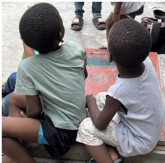
Gangs exploit children in various tasks such as collecting information. With thousands of people displaced by the violence, many children are at risk of recruitment and use by the gangs.

Amnesty International interviewed three girls who were used by various gangs to do chores, such as cooking and cleaning, as well as doing deliveries. 74 Gang members "ask me to buy things for their girlfriends and to clean the house for them... they give me just 250 gourdes [around USD 2] to eat", said a 17-year-old girl who lives in an area controlled by the gang Ti Bwa. 75 A 17-year-old girl who lives in an area controlled by 5 Segon said: "I have cooked so many times for them... sometimes for a group of between 10 and 15 people... the last time I did that was last month... They send me the money; I make the meal and call them to come pick it up." 76