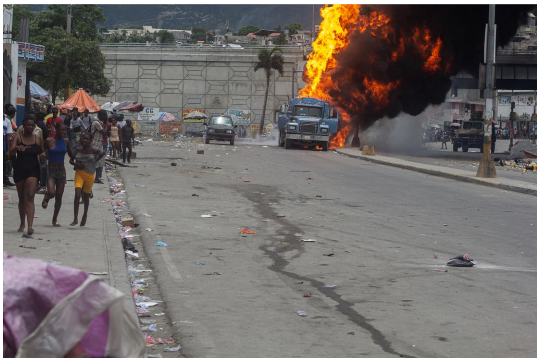
People fleeing after gang members who were trying to seize a diesel tanker fired a projectile causing the truck to explode, Port-au-Prince, 4 June 2024.

“I’M A CHILD, WHY DID THIS HAPPEN TO ME?” GANGS’ ASSAULT ON CHILDHOOD IN HAITI