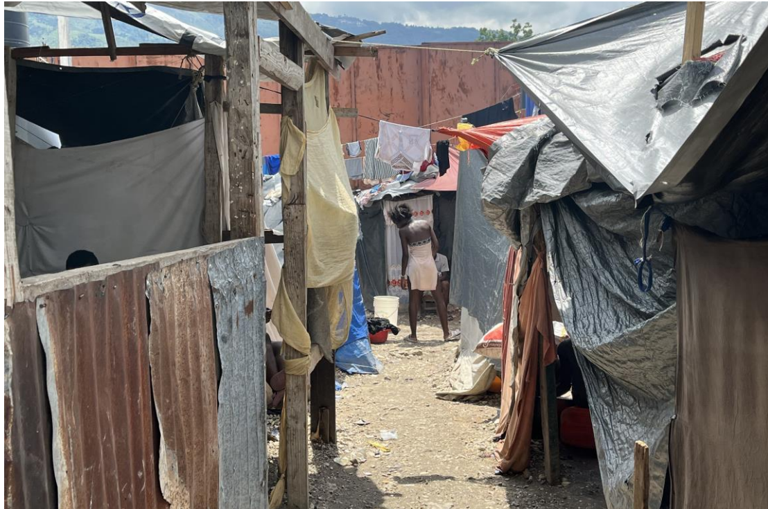
Mass displacement has historically left women and girls in Haiti at increased risk of sexual violence. According to the UN, the repeated waves of displacement in 2024 have caused "unprecedented" levels of such violence.

The CRC also requires states to protect children from sexual exploitation and abuse, including prostitution, as well as from torture, cruel, inhuman, or degrading treatment, which includes acts of rape and sexual violence. 166 In addition, under the Optional Protocol to the Convention on the Rights of the Child on the sale of children, child prostitution and child pornography states must prohibit and prevent the exploitation of children in commercial sex, as well as take all feasible measures to support survivors with their physical and psychological recovery. 167 Regional instruments also require states to prohibit sexual violence. 168