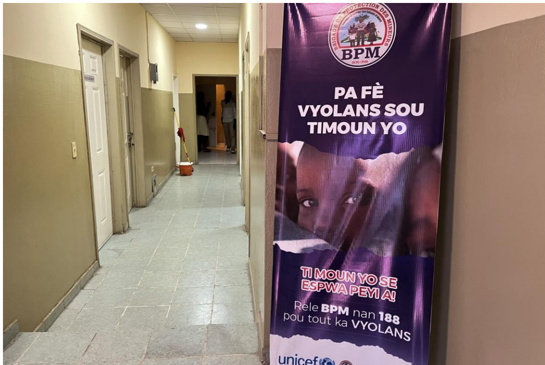
A poster at one of the central offices of the Haitian National Police’s Brigade for the Protection of Minors describes children as the “country’s hope” and warns not to commit violence against them.

These testimonies and digital evidence highlight the extent of work needed to ensure effective community healing for any reintegration process to work. Any reintegration processes must not be top-down. Haitians have had little faith in successive central governments, 135 and so community-based processes that would be more relevant to the affected communities and gain their support should be prioritized.