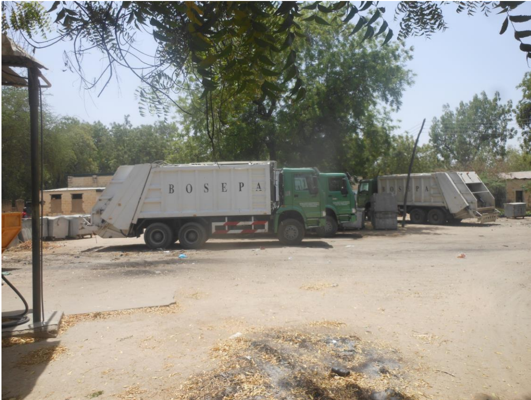
Borno State Environmental Protection Agency truck. These trucks were used to transport corpses from the mortuary to Gwange cemetery, Maiduguri. March 2014.

members, arbitrarily arrested at least 20,000 people since 2011. Most of those arrested were young men, although Amnesty International has recorded arrests and detention of boys as young as nine years old. The vast majority of arrests carried out by the military appeared to be entirely arbitrary, often based solely on the dubious word of an informant. On numerous occasions, particularly following Boko Haram raids, soldiers have gone to the town or village, rounded up hundreds of men and boys and taken into custody those identified as Boko Haram by informants. Military sources repeatedly told Amnesty International that the informants were unreliable and often provided false information in order to get paid.