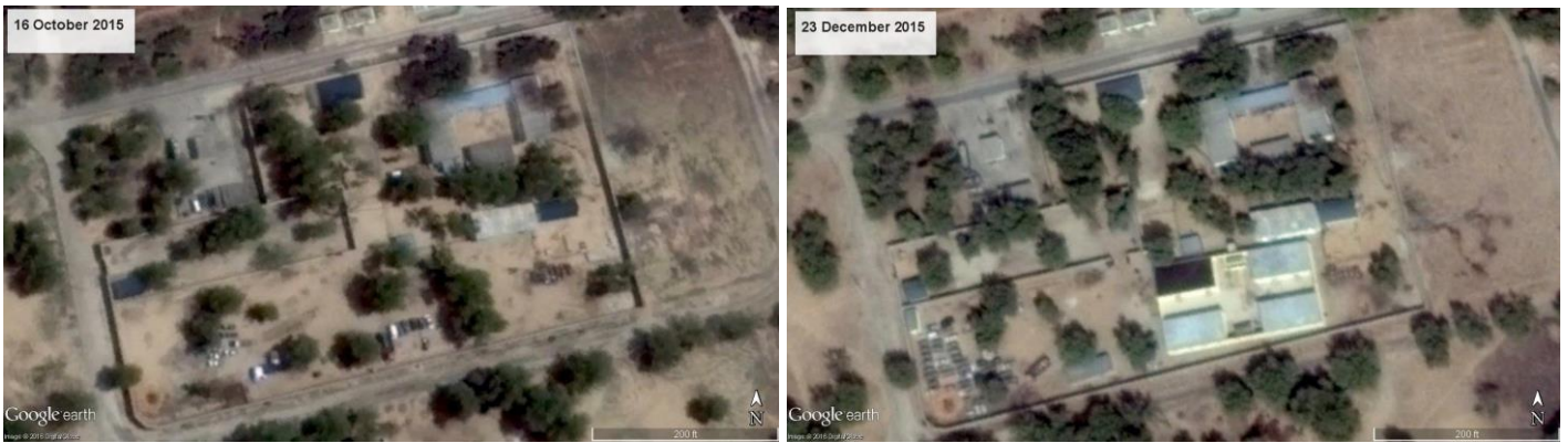
Satellite images show construction work in the detention facility at Giwa barracks between October and December 2015. These images correspond to the testimony of people detained in recently constructed cells in January 2016.