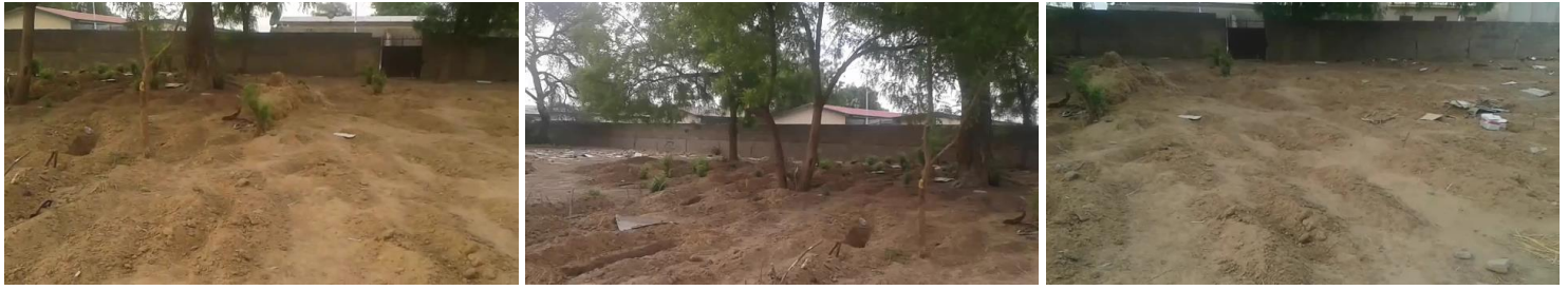
Recently disturbed earth by the southern gate of Gwange cemetery, Maiduguri. Witnesses saw BOSEPA staff bring bodies to the gate in a rubbish truck. These images show the likely site of grave. April 2016.

Mallam Babagana (not his real name) works by the side of the road a few hundred meters from the cemetery's southern gate. He told Amnesty International that since November 2015, a BOSEPA rubbish truck has visited the cemetery in the morning, two to three times a week.