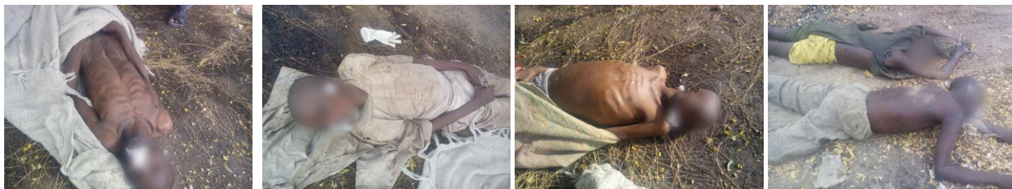
Corpses of detainees from Giwa Barracks, deposited at a mortuary in Maiduguri in February and March 2016.