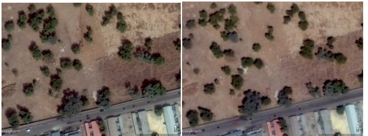
Satellite images show disturbed earth by the southern gate of Gwange cemetery, Maiduguri. These images were taken on 2 January and 17 February 2016.