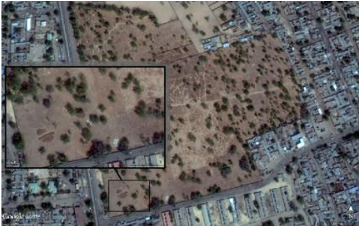
Gwange cemetery, Maiduguri. Imagery taken 6 March 2016.